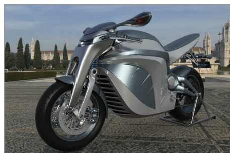
Electric motorbike concept