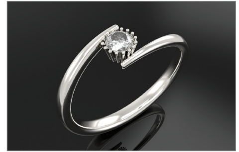
Diamond ring rendering

are capable of representing any desired shape, both analytic and free form, and their algorithms are extremely fast and stable. Full NURBS-based modeling, construction history, and the most advanced modeling tools make Evolve a matchless tool for designers.