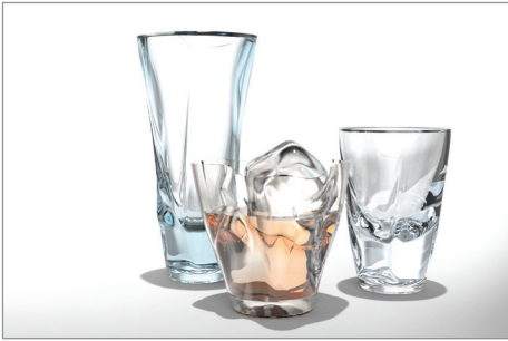
Set of glasses modeled and rendered in Evolve