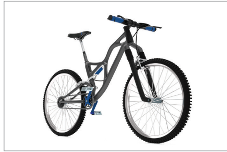
Bike with optimized frame