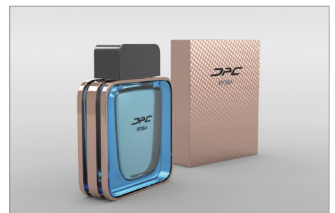
Perfume bottle concept